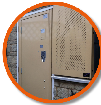
Clearway Keyless Toredoor

Clearway's vacant property security screens are typically installed in conjunction with Clearway Keyless Toredoor and the inView Video Verified Alarm System to complete a full vacant property security service.