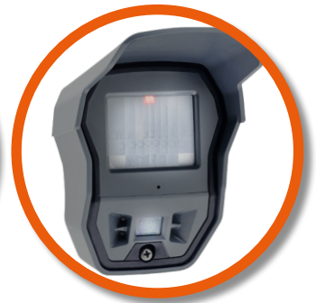
inView Video Verified Alarm System